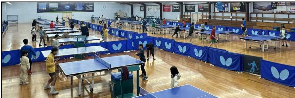
2024 July School Holiday Coaching programme in action at the Auckland table tennis stadium