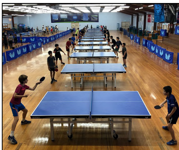
Participants in action at the 2020 July School Holiday Coaching programme

October 2020 – 97 students (from 108 students in 2019)