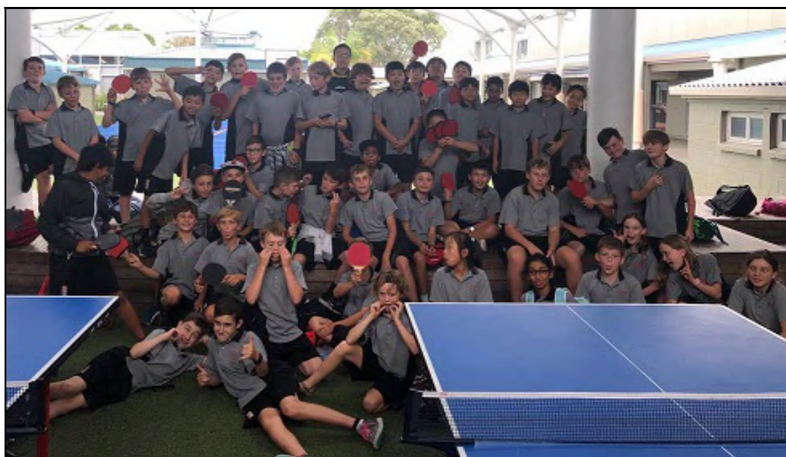
Students at Ponsonby Intermediate ready to partake in a table tennis development coaching session

Dinyar Irani delivered regular development coaching sessions to schools including ACG Parnell College, Glendowie College, and Pakuranga College.